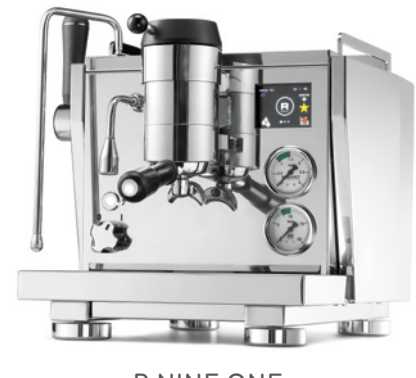
R NINE ONE