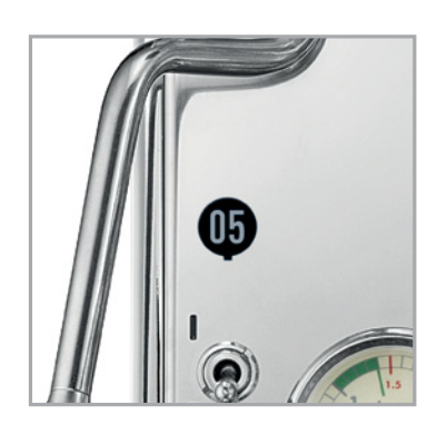
Cronometro machines are equipped with shot timer as standard.

The Giotto and Mozzafiato Cronometro V machines introduce users to the Rocket Espresso movement for better espresso in the home without compromise.