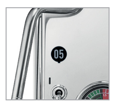
Cronometro machines are equipped with shot timer as standard.

The Cronometro machines are offered in two different body styles, the Giotto or the Mozzafiato.